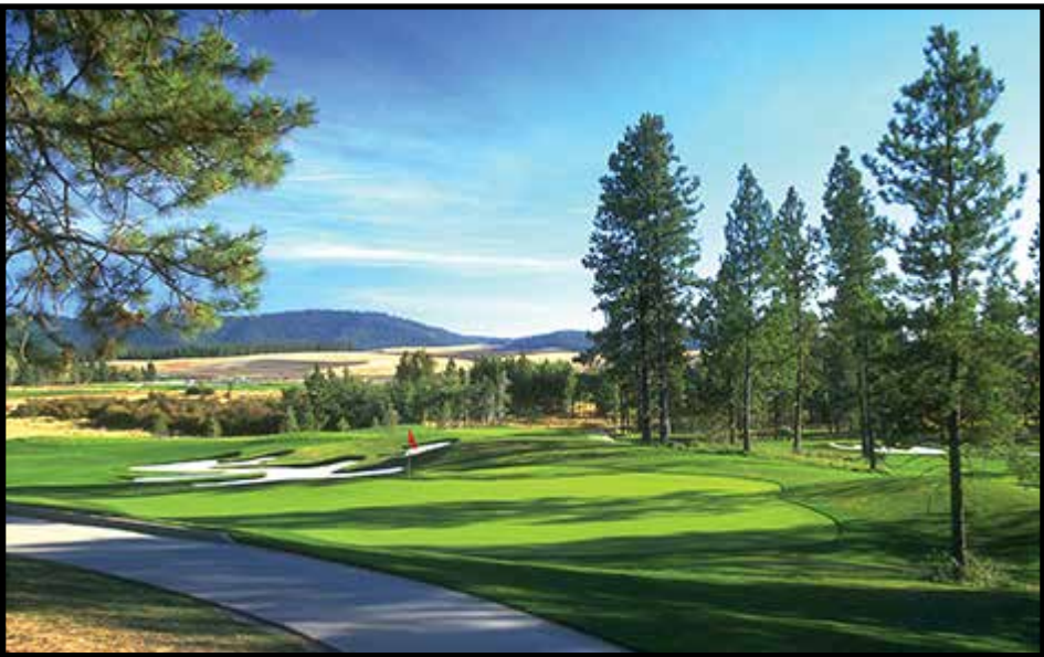
Circling Raven Golf Club, owned by the Coeur d'Alene Tribe, will host the Symetra Tour in 2021.