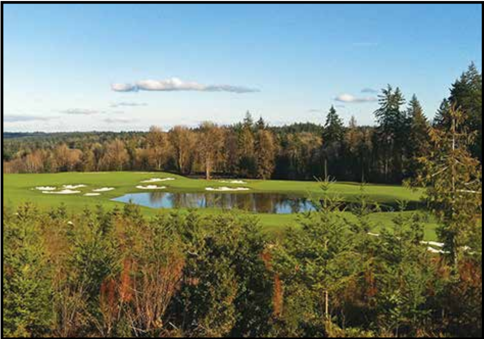
The Puyallup Indian Tribe got into the golf business a few years ago by buying North Shore Golf Course in Tacoma (top); the Squaxin Island Tribe developed its own golf course when Salish Cliffs opened up.