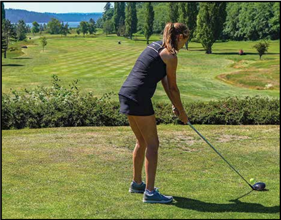
The Swinomish Tribe in Anacortes bought Siimilk GC and renamed it Swinomish Golf Links.

Most recently, the Chehalis Indian Tribe bought the Oaksridge Golf Course in Elma, Wash.